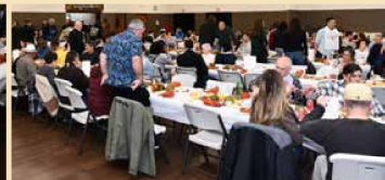
After the cooking is done, the food is carefully laid out on tables, for the diners' delight.